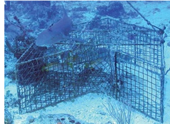
Areas - Bajo de Sico, Tourmaline Bank & Abrir la Sierra Bank